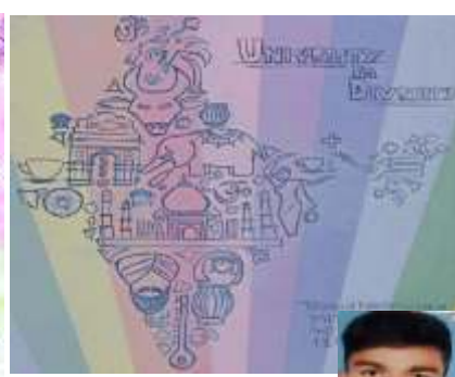
Tejaswi Narayan Singh 12D, Roll no. 40